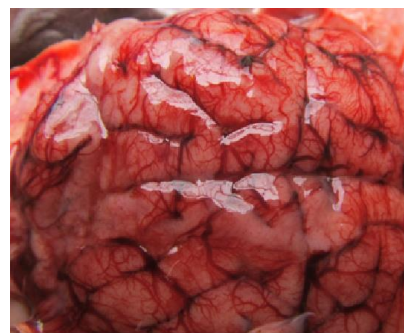
Fig. 2: Brain of an aborted sheep fetus. Severe congestion and edema in the brain

Hyperemia and edema were the most common lesions (86%) in the pathological examinations (Fig. 2) and were followed by encephalomalacia (10.3%), meningitis (10.3%), leukomalacia (6.8%), meningoencephalitis (3.4%), demyelination (3.4%), gliosis (3.4%), but Toxoplasma cyst wasn't found in any of the specimens.