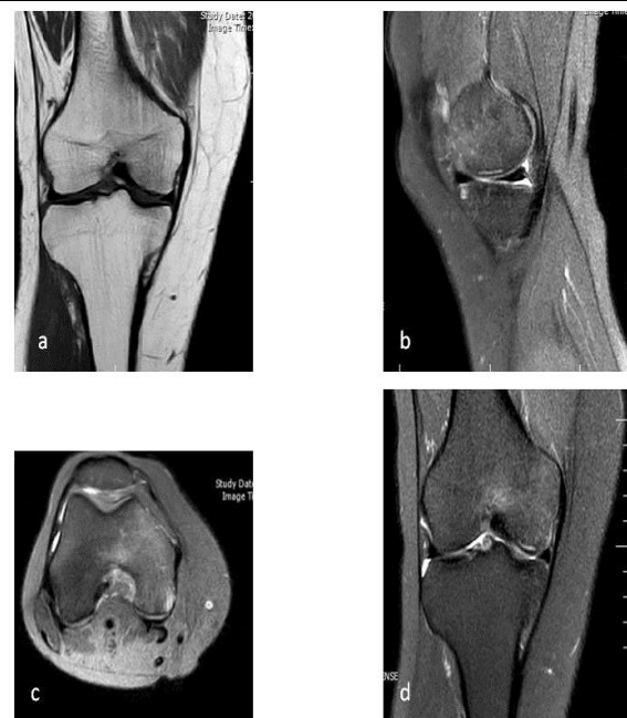
Figure 2. Second MRI which was taken 6 weeks after conservative treatment, including non-weight bearing, non-steroidal anti-inflammatory medications, and bisphosphonates. Coronal T1(a), sagittal T2 (b), axial T2 (c), and coronal STIR (d) weighted images show a decrease in the bone marrow edema, compared to before. b and d illustrate the natural appearance of the focal linear subchondral hyperintensity in femoral medial condyle

The NSAID was discontinued while he was suggested to continue taking alendronate as before. He