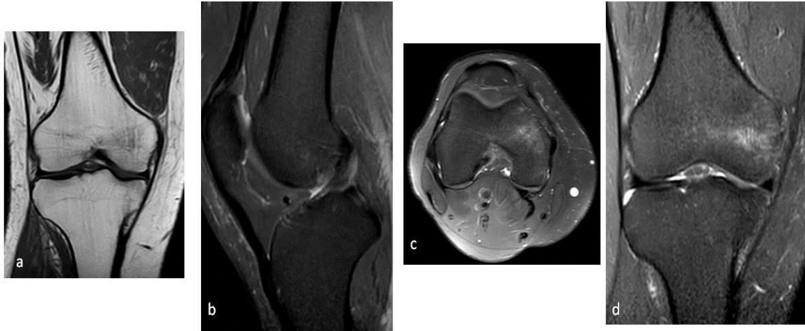
Figure 3. Coronal T1 (a), sagittal STIR (b), axial T2 (c), and coronal STIR (d) weighted images depict the significant decrease of medial condyle of femur bone marrow edema and subsidence of focal subchondral linear hyperintensity

continued to feel better as the pain significantly decreased and was able to walk without crutches. The second follow-up MRI after 3 months showed significant shrinkage of the edematous area (Figure 3).