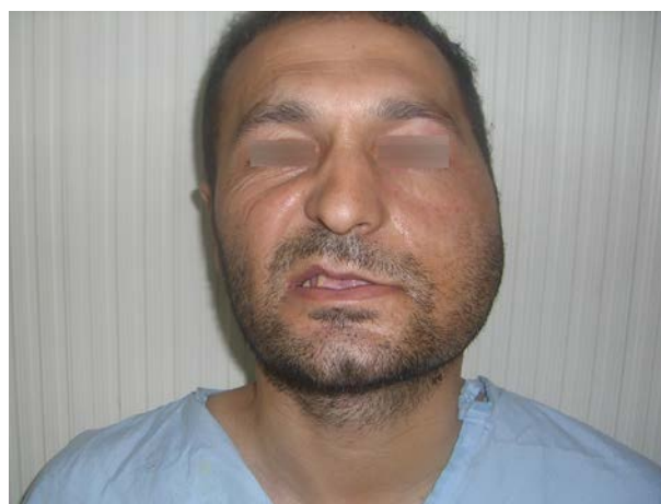
Figure 1. Patient on Arrival

and compression bandage, he was taken to the operating room (Figure 1).